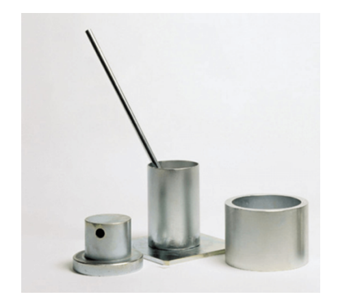
Fig. 3: Example of BS812-110 test device<sup>2)</sup>

JIS A 1121: "Abrasion test method for coarse aggregate using Los Angeles test equipment" is one of the current standards for aggregate strength and hardness. However, this test method evaluates only the abrasion resistance of aggregate and not its strength.