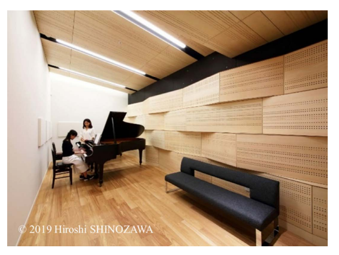
Fig. 5 A lesson room