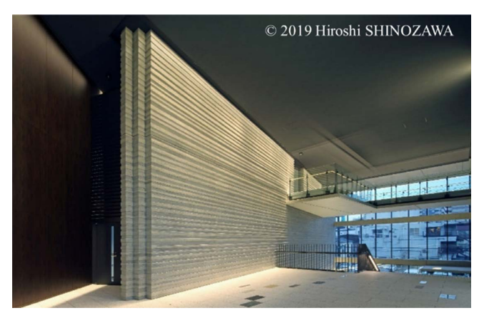
Fig. 7 Entrance hall (second floor)

The building is designed as a robust reinforced concrete