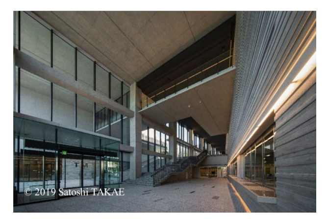
Fig. 8 Entrance (first floor)

For the superstructure, the building is divided into two distinct areas that are connected by a bridge on the third floor ( Fig. 6 ). On the other hand, the bridge has no expansion joints, leading to a continuous structure with a 500-mm-thick flat slab.