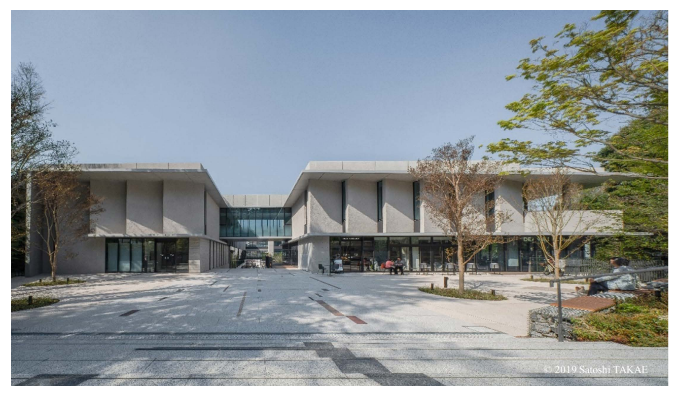
Fig. 3 External appearance for the Daikan-yama area