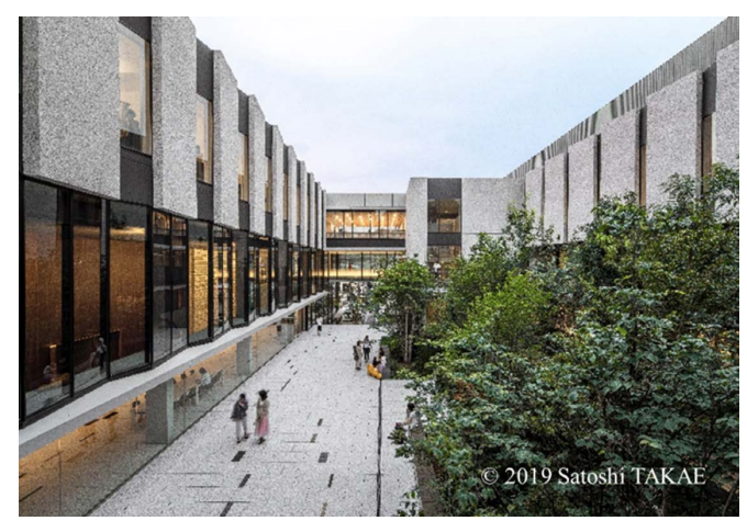
Fig. 4 "Music Forest" inner garden

The façade facing the north-south street (that runs