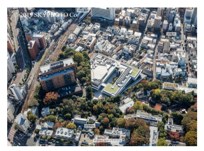
Fig. 1 New campus and its surrounding neighborhoods

Site Area: 8,538 m<sup>2</sup> Width: 24.0 m Building Area: 5,543 m<sup>2</sup> Gross Floor Area: 17,720 m<sup>2</sup> Owner: Tokyo College of Music Designer: Nikken Sekkei Ltd. and Toda Corporation Ltd., a Joint Venture for Design of Tokyo College of Music New Campus Contractor: Toda Corporation Ltd. Construction Period: Oct. 2016 – Jan. 2019 Location: Kami-Meguro, Tokyo, Japan