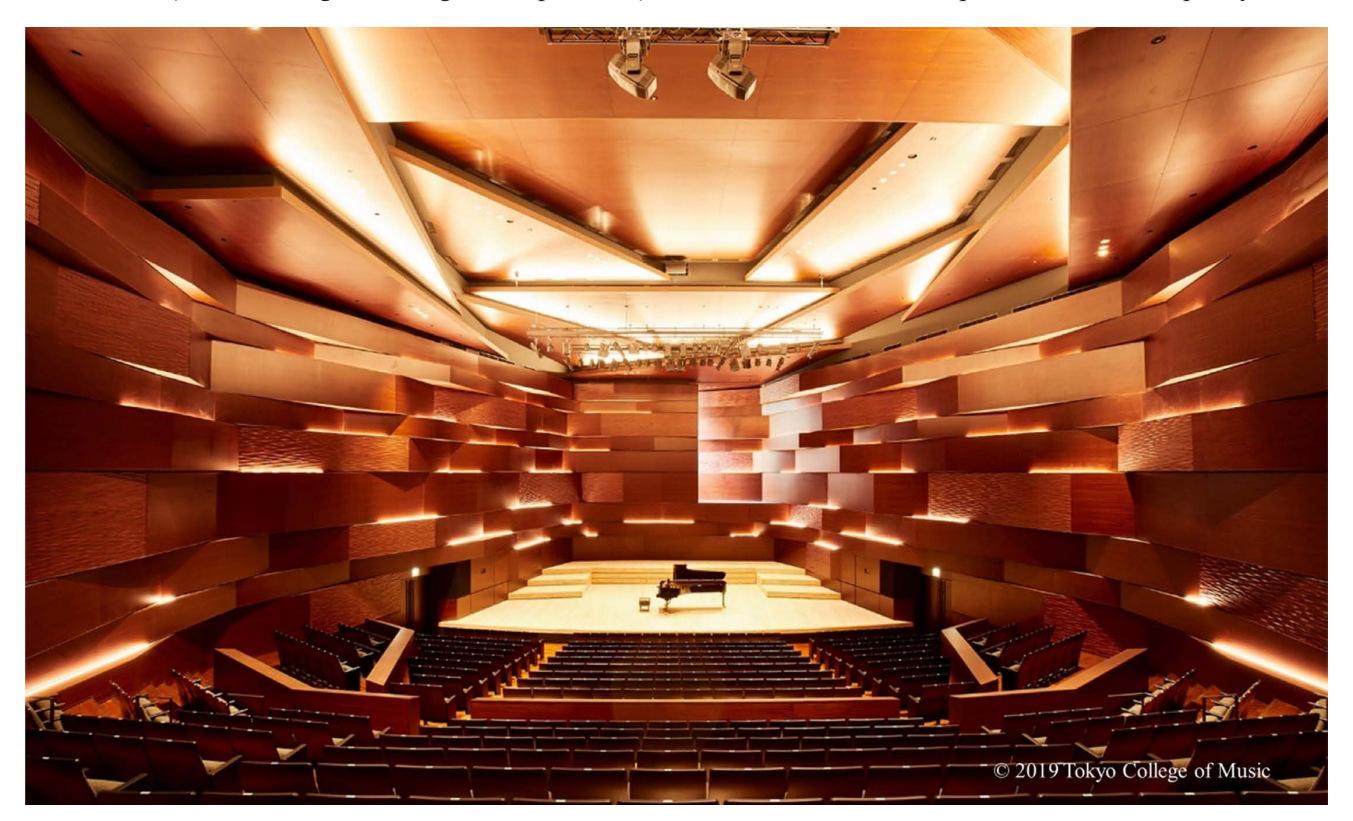
Fig. 9 Interior space of TCM Hall

To blend in with the surrounding natural environment, the outer walls of the first floor were also designed with concrete using uneven cedar board formwork. During construction, multiple mockups were produced with different concrete mixes to examine the shrinkage rate, color, and ease of removing the formwork. To prevent formwork assembly mistakes, the cedar board formwork was brought to the site as factory-made panel units and built in to improve construction quality.