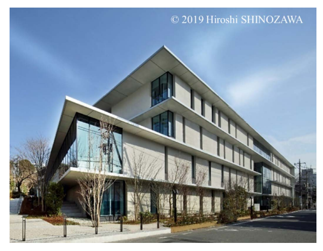
Fig. 2 External appearance for the Naka-Meguro area