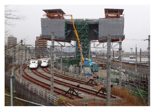
Fig. 7 Cantilever construction over the depot

25,000 V overhead power lines. This safety distance could not be obtained with conventional form travellers in which the formwork system and working platforms supporting the scaffolding are separated. Therefore, the safety distance from the power lines was obtained by integrating the formwork system with the working platforms. Assembly and disassembly of scaffolding units from form travellers over the depot poses a risk of falling objects such as concrete residues and dropped tools and materials. A safety sheet was installed on the scaffold exterior to catch any falling objects (Fig. 7). The sheet was suspended from the frame of the form traveller and separated from the scaffolding units, creating a work environment in which materials and equipment could not fall into the depot during any operations, including assembly and disassembly of the scaffolding units.