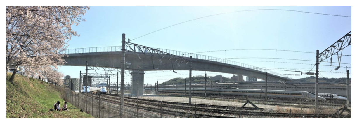
Fig. 9 View from the north

Hiroshima Expressway Route 5 is expected to improve the speed and timeliness of travel between the center of Hiroshima City and Hiroshima Airport, ease traffic congestion in the surrounding area, and promote urban development. The Yaga Overpass Bridge plays a part in these expectations, serving as a high-quality bridge constructed over the Shinkansen depot and providing an important lifeline that does not interfere with rail transportation. The completed Yaga Overpass Bridge harmonizes and integrates with the Shinkansen and rows of cherry trees on the depot's north side, creating a new landscape that will take root in the community ( Figs. 8 and 9 ).