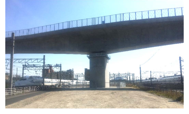
Fig. 4 Bridge pier in train yard

To reduce the number of piers, thereby minimizing the construction and maintenance impact on the depot, pier positions were set around 150 m apart, the maximum span possible for the cantilever construction method. Since the location where the pier could be constructed in the depot was limited to the area between railway tracks, the foundation type was chosen to be a steel pipe sheet pile foundation, rather than a large conventional case-in-place pile foundation, allowing it to accommodate future road widening construction.