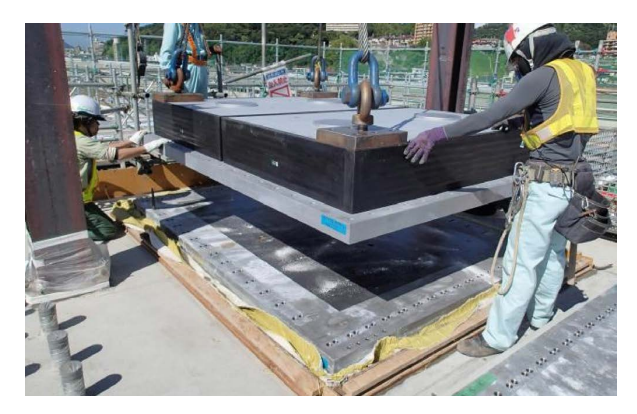
Fig. 5 On-site assembly of rubber bearings

The existing emergency lane at the P2 pier will be removed during the future road widening. The nonabutment pretensioning prestressing (NAPP) method, which uses pretensioned hollow PC steel bars, was applied to introduce prestressing in the top slab of the emergency lane that will be removed upon conversion