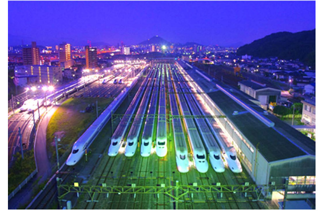
Fig. 2 Panoramic view of depot (before construction)