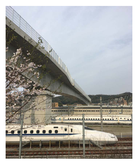
Fig. 8 View from the starting point

25,000 V overhead power lines. This safety distance could not be obtained with conventional form travellers in which the formwork system and working platforms supporting the scaffolding are separated. Therefore, the safety distance from the power lines was obtained by integrating the formwork system with the working platforms. Assembly and disassembly of scaffolding units from form travellers over the depot poses a risk of falling objects such as concrete residues and dropped tools and materials. A safety sheet was installed on the scaffold exterior to catch any falling objects (Fig. 7). The sheet was suspended from the frame of the form traveller and separated from the scaffolding units, creating a work environment in which materials and equipment could not fall into the depot during any operations, including assembly and disassembly of the scaffolding units.