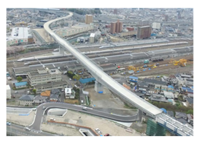
Fig. 1 Yaga Overpass Bridge

Structure: 3-span continuous PC box girder bridge Bridge Length: 321.854 m Span: 83.100 m + 152.000 m + 83.954 m Width: 10.0 m (14.0 m including emergency lane) Operating Entity: The City of Hiroshima Ordered by: West Japan Railway Company Designer: JR West Japan Consultants Company Contractor: Taisei–Kosei joint venture Construction Period: Nov. 2016 – Mar. 2020 Location: Hiroshima Prefecture, Japan