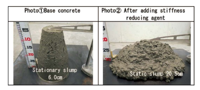
Fig. 1 Comparison of static slump test results